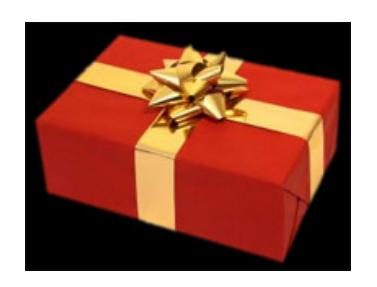
Click on the gift for the special Christmas article!