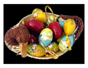
Click on the basket for the special Easter article!