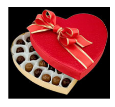
Click on the chocolates for the special Valentine's Day article!